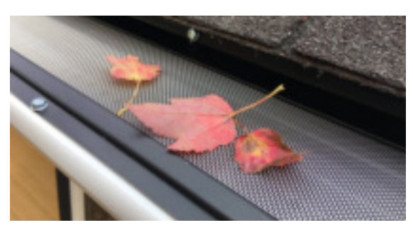
Protect your home from costly water damage and eliminate the dangerous and dirty chore of gutter cleaning!