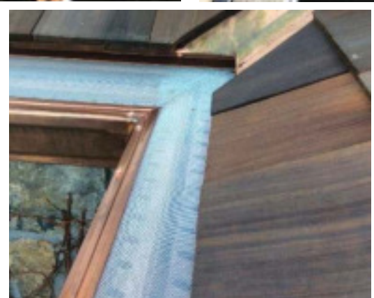
*Available in copper