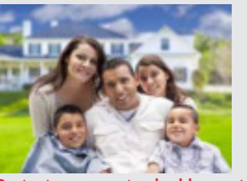
Protect your most valuable asset