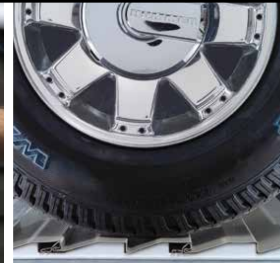
Contoured insulation give Charter Oak Energy Elite additional support and increased durability.