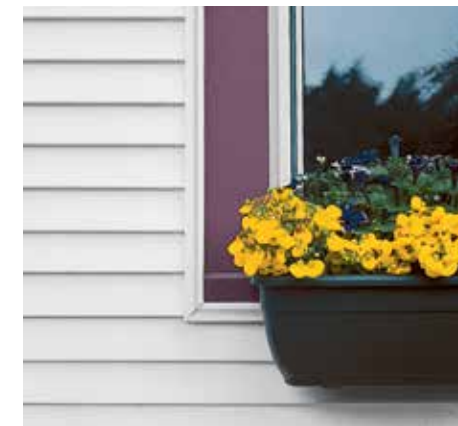
Trimworks custom crown molding used with wood window trim.