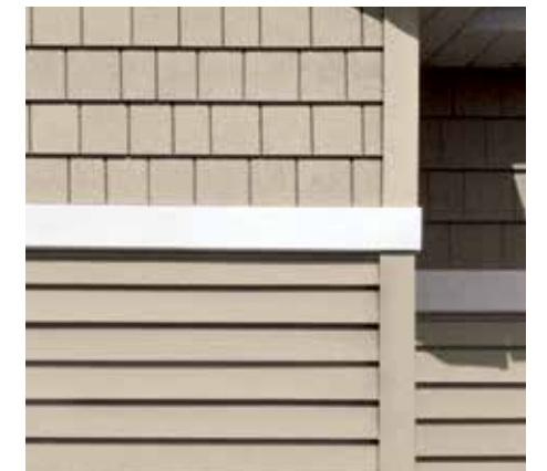
Horizontal band board provides a strong horizontal accent.