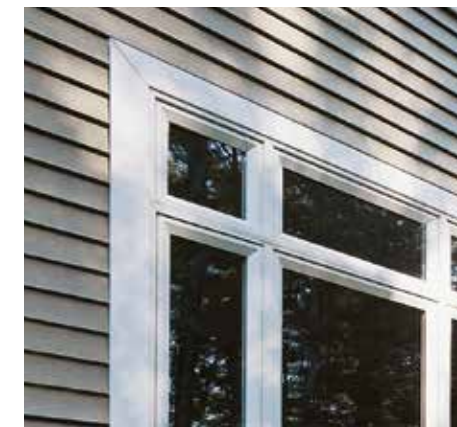
Charter Oak clapboard with Trimworks 5" window trim.