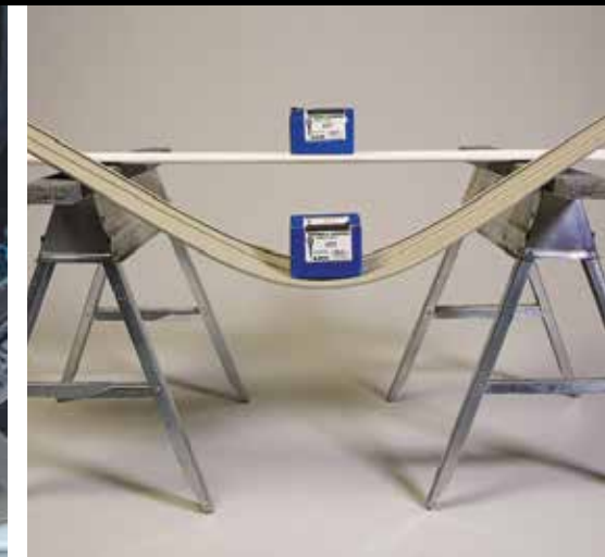
In strictly controlled laboratory comparisons, Charter Oak remained rigid, while the competition sagged.

CHARTER OAK ENERGY ELITE IS AN INVESTMENT that really pays dividends. Energy savings and freedom from maintenance are so desirable that chances are your new siding can more than pay for itself in increased home value. And it will always be a pleasure to live with.