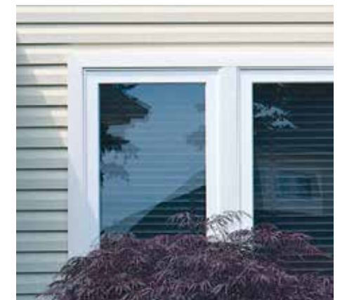
Charter Oak dutch lap with Trimworks 3-1/2" window trim.