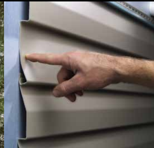
Traditional siding yields a hollow void between the siding and the wall.