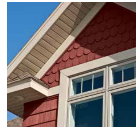
Alside Premium Scallops – Victorian inspired half-round shingles.