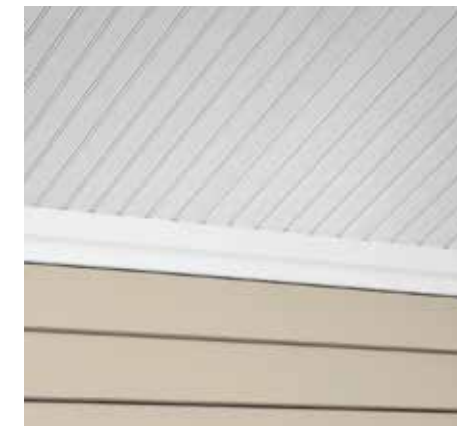
Greenbriar® Vintage Beaded soffit and Trimworks soffit crown molding.