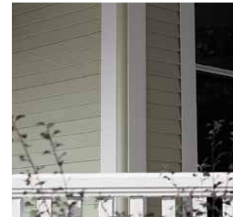
Trimworks three-piece beaded corner post.

Alside offers a wide selection of trim and accent products made to complement the beauty and colors of Charter Oak Energy Elite siding.