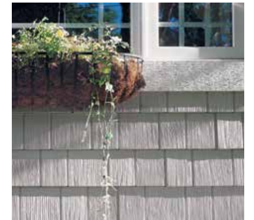
Alside Premium Shakes – the classic look of deep-grained cedar shakes.